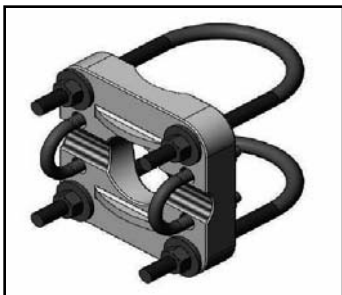
BWC1001 yagi clamp, fits mast of 0.5" - 0.84" OD